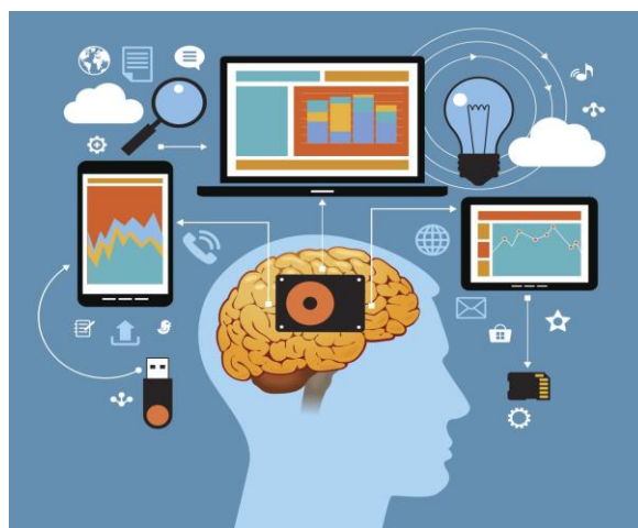
Figure 1. Image from project Dialogue Report.

Government understands that it is vital to engage with the public on new technologies and communicate effectively as these technologies develop 1 . This motive led to the commissioning of a public dialogue to inform the Framework for Data Science Ethics. The GDSP defines data science as a field which “combines statistics, programming, machine learning, automatic processing of unstructured data (including text mining) and visualisation.” 2 It is a fast growing field which is recognised by the Alan Turing Institute as posing “pressing issues of fairness, responsibility, and respect of human rights.”