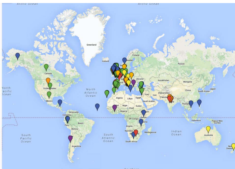
Figure 1 Food map

“Food on TV” – forum space where participants shared their thoughts and recommendations for food related programmes.